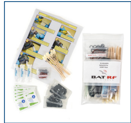
810-0070 – Refurb Kit for AirBAT Hoses

Thank you for your continued support of STEMCO.