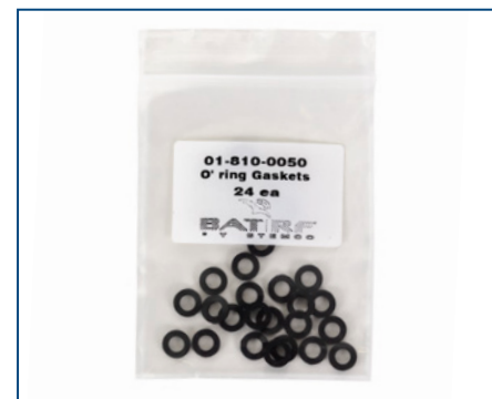
810-0050 – Valve Gaskets