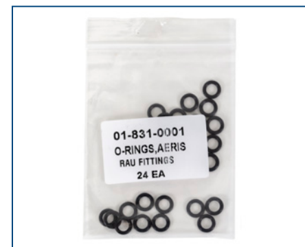
810-0001 – AERIS RAU Fittings