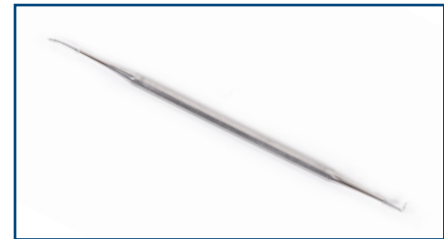
810-0071 – O-ring Removal Tool