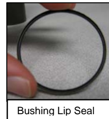
Bushing Lip Seal

Improper installation of these seals may result in decreased king pin assembly performance.