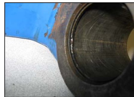
Close-up showing seal placement in bore