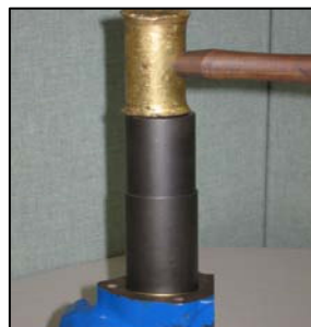
Use brass or dead-blow hammer to install