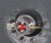
AERIS™ BY STEMCO