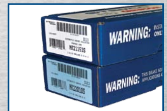
Blue box label for easy identification

NOTE: 1.30" Pin Spacing is typical of welded clevis applications used on International, Freightliner, Mack and Volvo trucks.