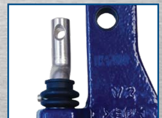
Silver lift rod for easy identification