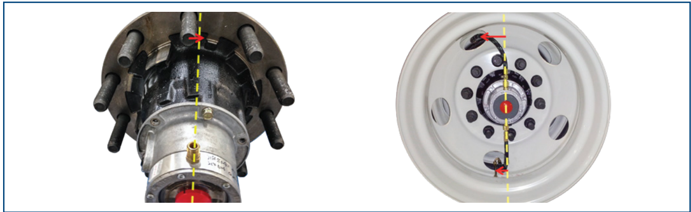
Figure 1: Best Hub and Wheel Clock - Hubcap fitting slightly clockwise from stud, inner tire valve stem counter clockwise from fitting, outer tire valve stem slightly clockwise from fitting.

Wheels with 5 hand holes require special clocking of the hub and wheels to ensure proper fit of hoses. There are three possible clock positions that can be used when mounting the hubcap to the hub. By lining up the hubcap hose fittings with the wheel studs, the hubcap can be properly clocked to the hub.