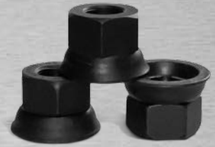
Genuine Motor Wheel Cone Lock Nuts have “MW” marking for identification.