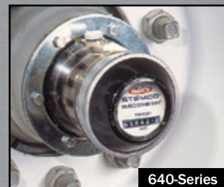
640-Series Grilamid Hubodometer® Hub Cap