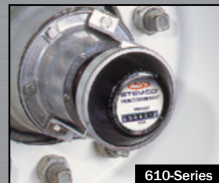
610-Series Bracket Installation

STEMCO LP - USA P.O. Box 1989 • Longview, TX 75606-1989 (903) 758-9981 • 1-800-527-8492 FAX: 1-800-874-4297 www.stemco.com