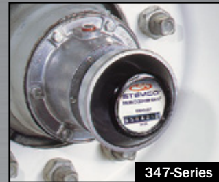
347-Series Aluminum Hub cap with Hubo Window

The STEMCO Hubodometer® is warranted for 500,000 miles when installed in accordance with its specifications. See your STEMCO distributor for details.