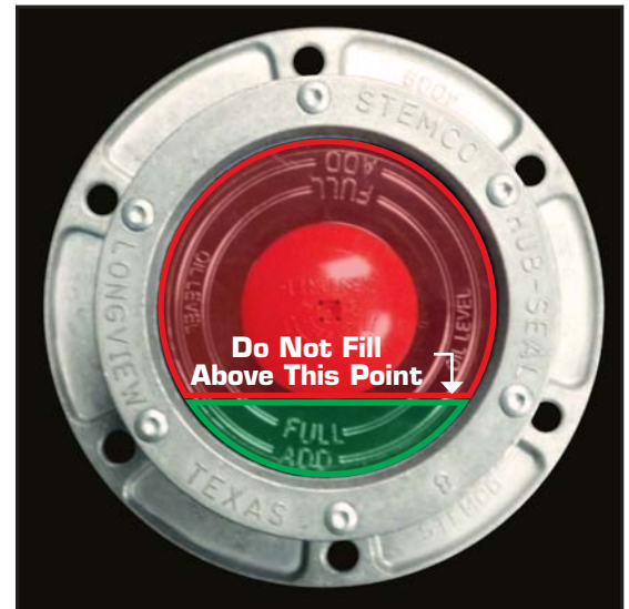
Figure 1: Fill Level for Oil