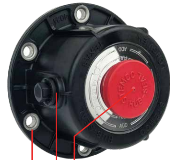
Vent Plug Stainless Steel Inserts

UNITED STATES | 800-527-8492 | 903-758-9981